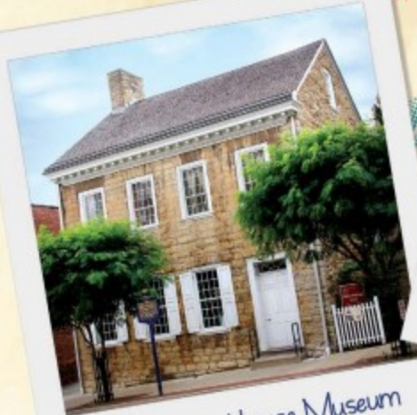
Bradford House Museum