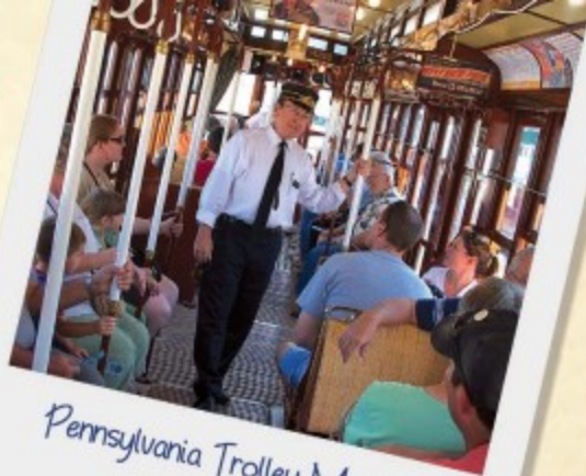
Pennsylvania Trolley Museum