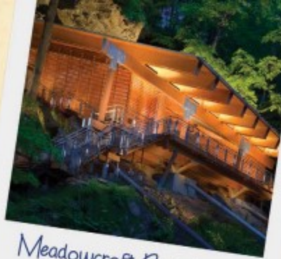
Meadowcroft Rockshelter and Historic Village